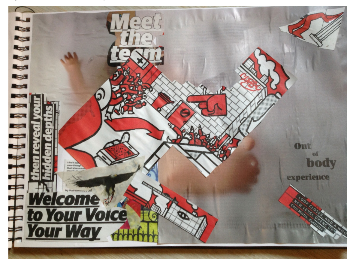
Figure 4: 'Co-creation and collaborative writing' by Sandra S.