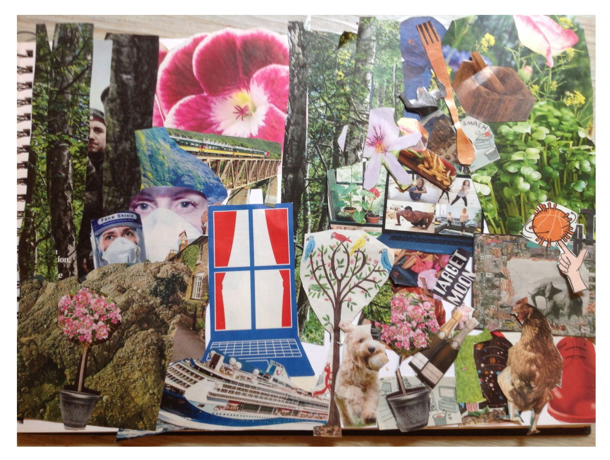
Figure 5: 'Bringing the different worlds together' by Tom B.