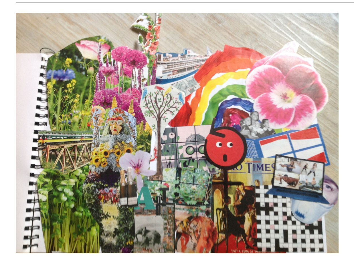
Figure 7: 'Empowered' by Tom B.