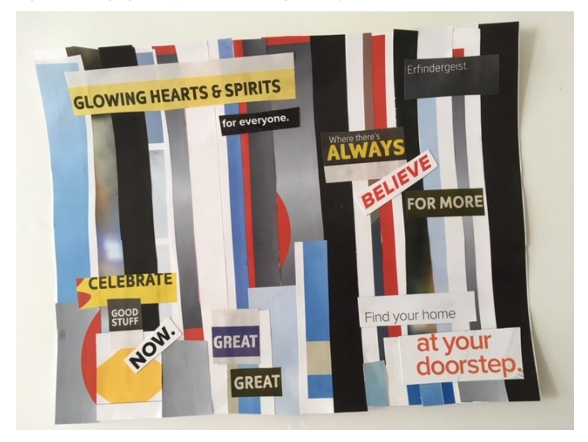
Figure 6: 'Glowing hearts & spirits' by Sandra A.