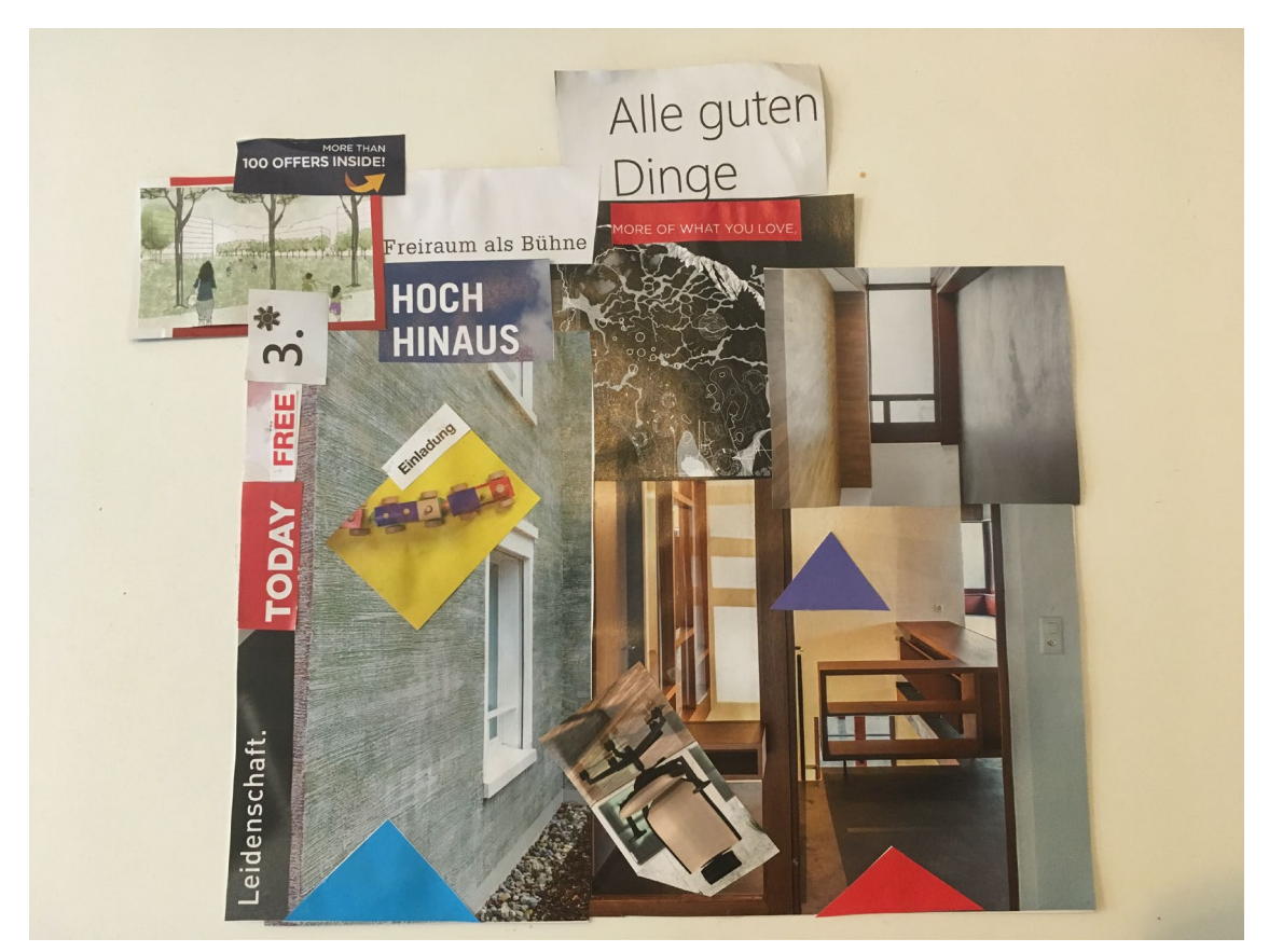
Figure 3: 'Hoch hinaus' by Sandra A.