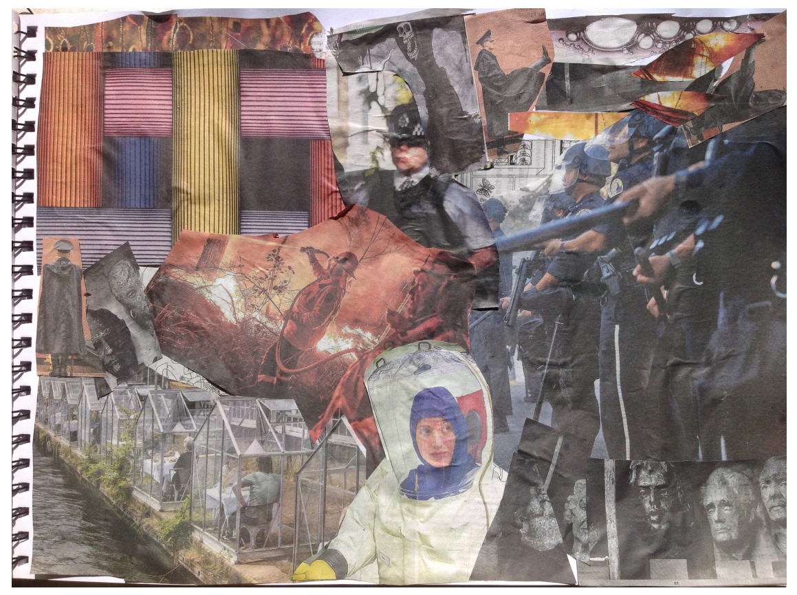
Figure 2: 'And where they are not' by Sandra S.