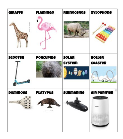
Object Cards: (Sample)