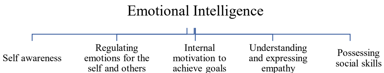
Figure 1: Emotional Intelligence

We employ our emotional intelligence every day in our social interactions with others (Ciarocchi et al., 2006; Goleman, 1995/2005). One general definition of emotional intelligence is the ability to recognize and regulate one's emotions (Wischerth et al., 2016). According to Goleman (1995/2005) emotional intelligence includes the skills and abilities involved in processing, understanding, interpreting, and regulating our own emotions and the emotions of social others. The five main components to one's emotional intelligence are: 1) self-awareness - evaluating and expressing emotions in oneself and others, 2) regulating these emotions in both oneself and others, 3) using internal motivation to plan and achieve certain tasks, 4) understanding and expressing empathy, and 5) possessing social skills. Because emotional intelligence improves mental processes, this can contribute to an enhancement in social outcomes, performance, and overall mental and physical well-being. These appear in Figure 1.