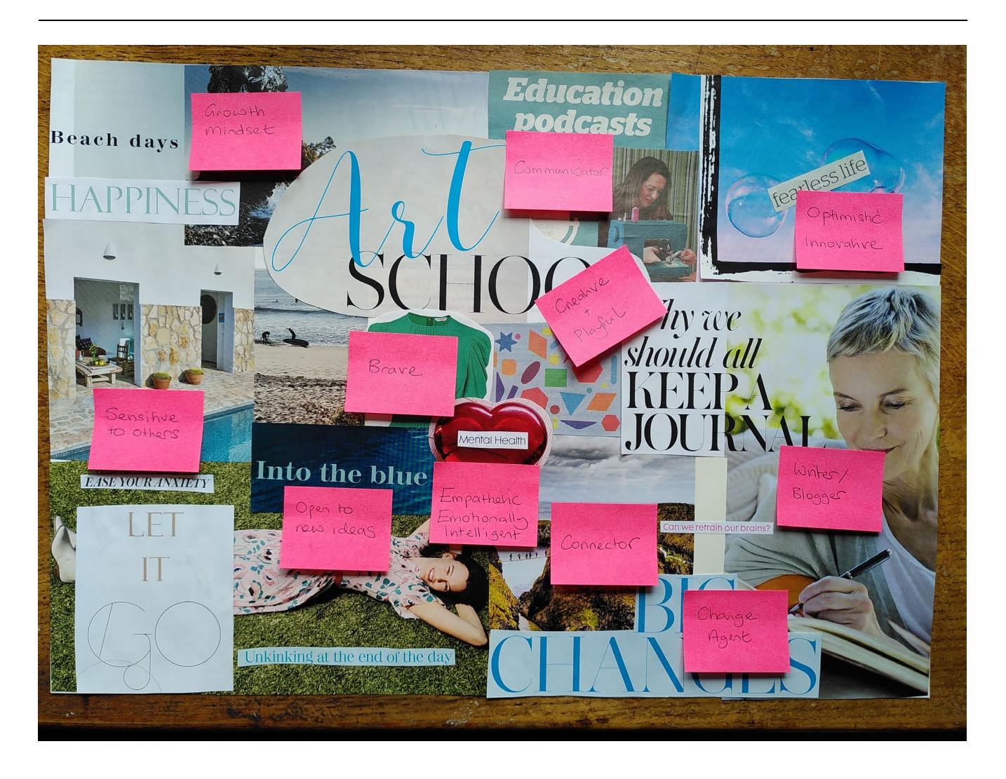
Fig 2 Collage