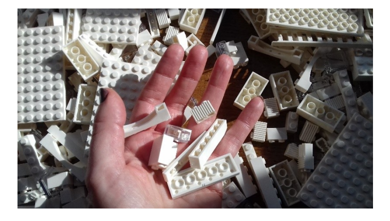
Fig 3 Mindful LEGO®

If you are happy to, please share any thoughts, reflections and suggestions that have bubbled up during the activity on a thought bubble card/post-it note and hang on a tree/add to a whiteboard.