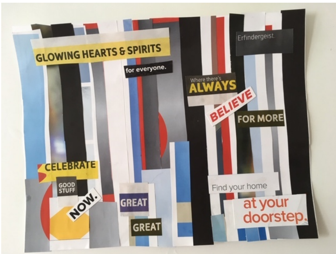
Figure 6: 'Glowing hearts & spirits' by Sandra A.