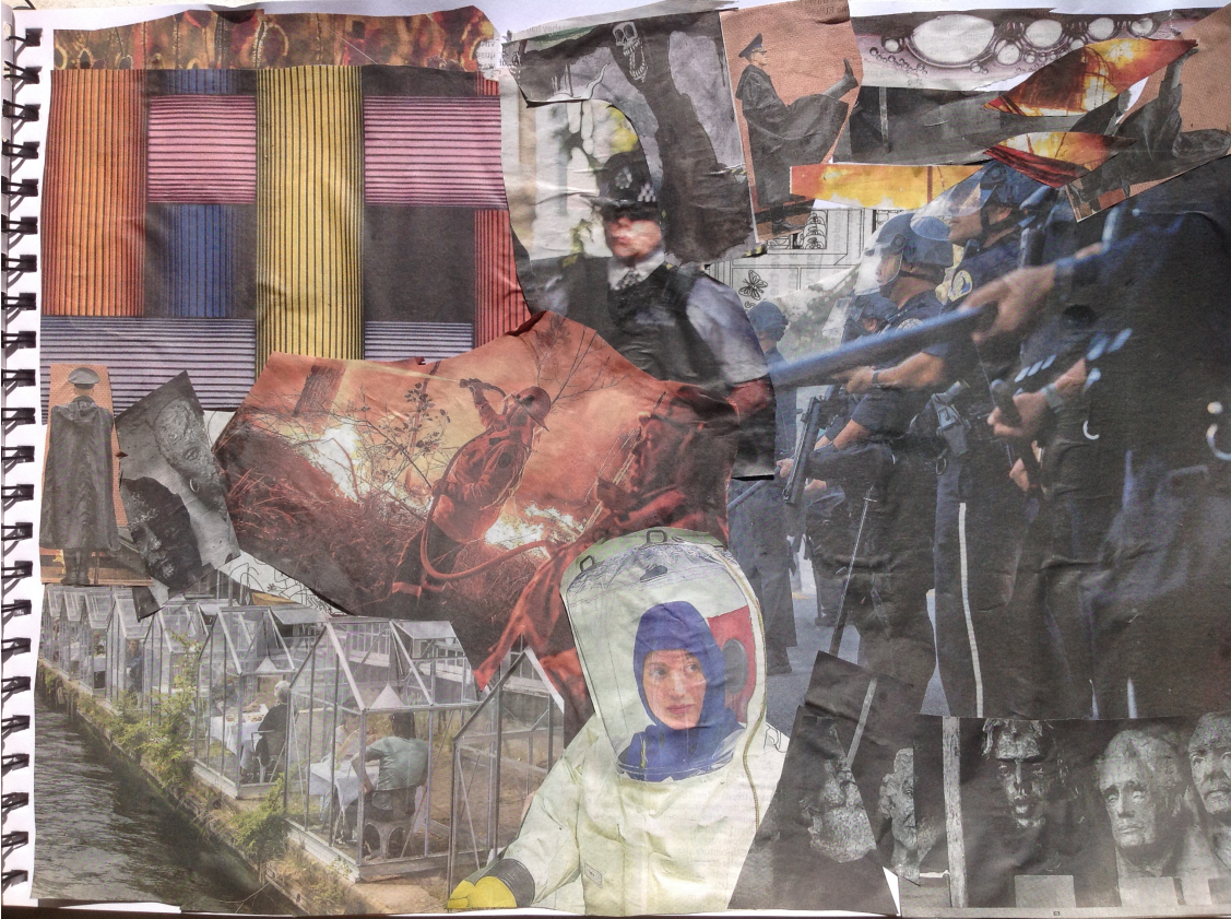
Figure 2: 'And where they are not' by Sandra S.