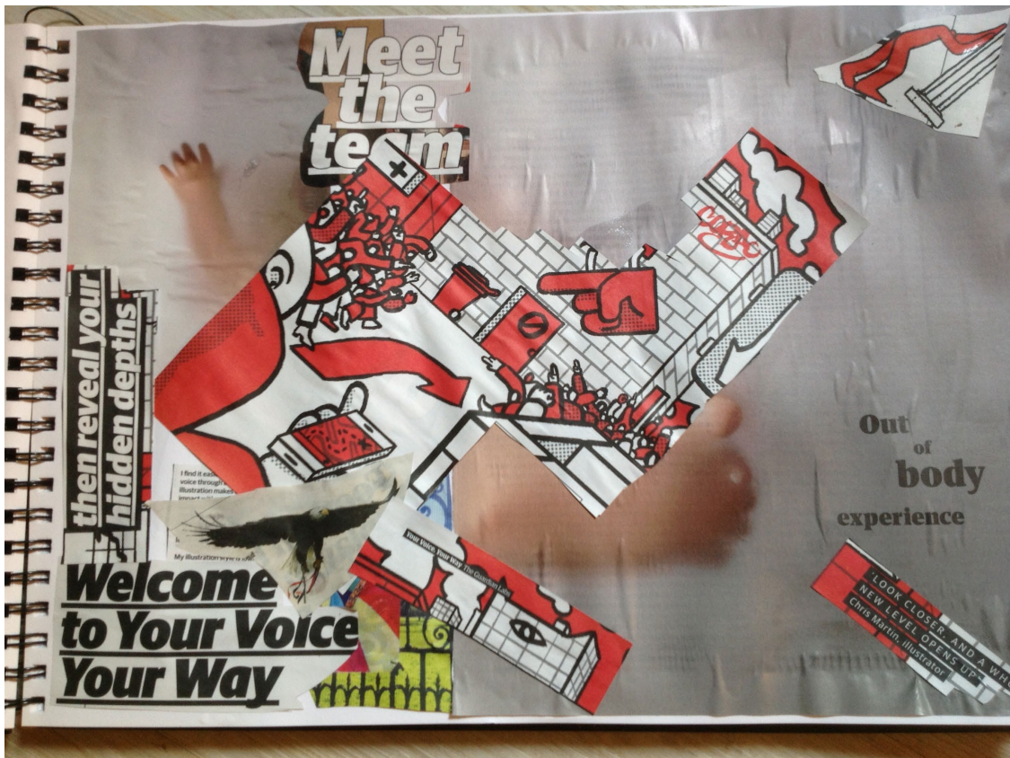
Figure 4: 'Co-creation and collaborative writing' by Sandra S.