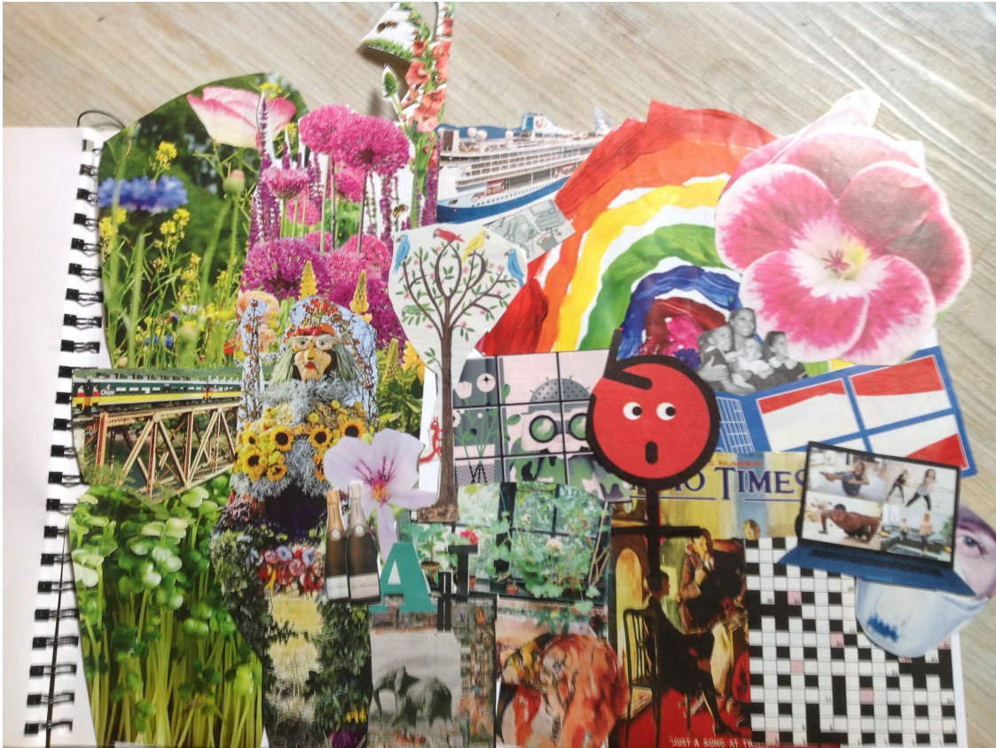
Figure 7: 'Empowered' by Tom B.