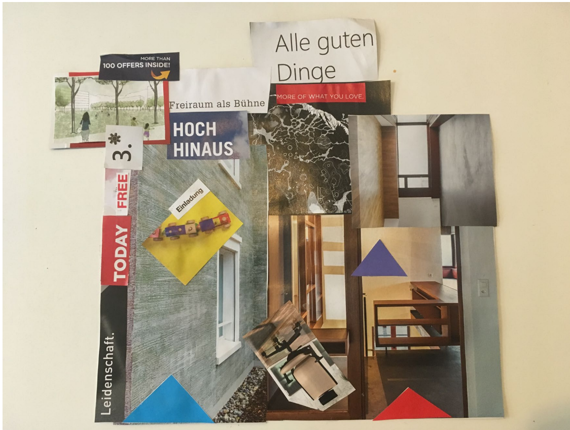
Figure 3: 'Hoch hinaus' by Sandra A.