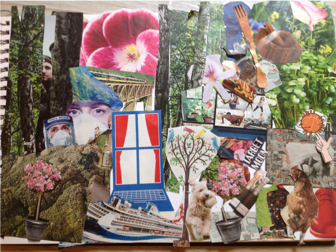
Figure 5: 'Bringing the different worlds together' by Tom B.